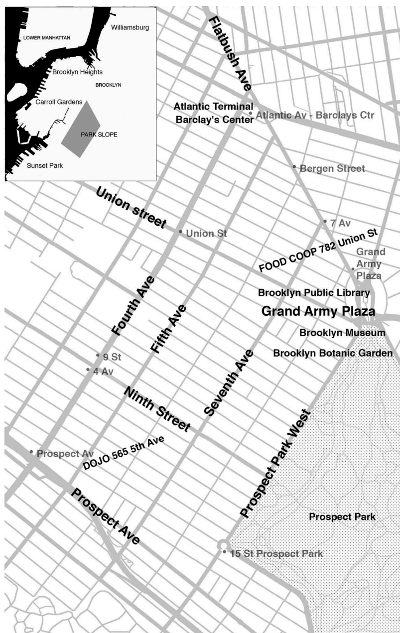
Figure 1. Brooklyn's park slope and its adjoining neighborhoods.